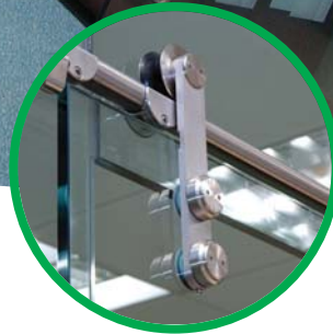
Single sliding glass door