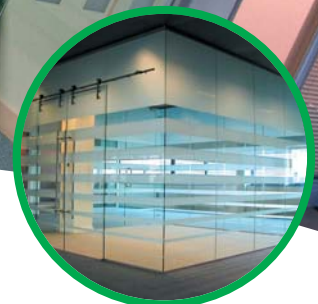
Double bi-parting sliding system