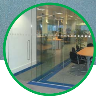
Free-swing door with locking latch sets