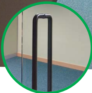
Tension door with D handle